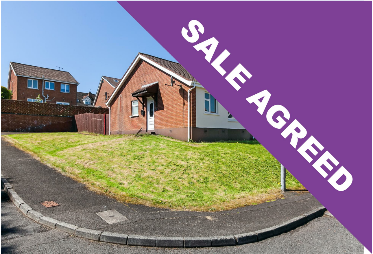
25 Hollybrook Grove, Newtownabbey, BT36 4ZR